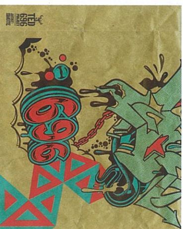
BMF won the AdNews Ad Campaign of the Year award for its "TED 696 Project" work for Lion Nathan.